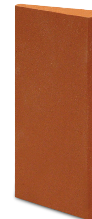
No. 6 I-Stone Wedge Shape | SS6 Medium Grit Follow with fine or super-fine grit stone for finishing. 4-1/2" x 1-7/8" x 3/8" down to 1/8"

Sharpening stones are not shown to size.