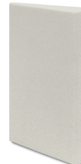
No. 6A Arkansas Thick Wedge | SS6A Hard Fine Grit Rounded edges for optional contouring. 4" x 1-7/8" x 3/8" down to 1/8"