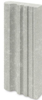
No. 5 Arkansas Bates | SS5 Hard Fine Grit Channeled stone for use with explorers, scalars, carvers and disc-shaped instruments. 4" x 1-1/2" x 1/2"