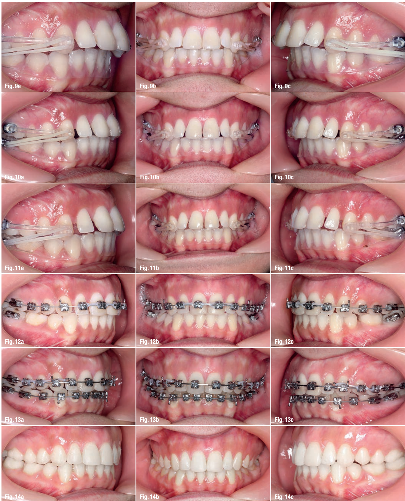
Figs. 9a–c: Situation after 1 month of correction with Sagittal First approach. – Figs. 10a–c: Situation after 2 months of correction. – Figs. 11a–c: Situation after 3 months of correction: Class I achieved. – Figs. 12a–c: Situation after 4 months of treatment (3 months of Motion sagittal treatment and 1 month in fixed appliances). .014" x .025" wire with power chain to close the spaces between the incisors. – Figs 13a–c: Situation after 7 months of treatment (3 months of Motion sagittal treatment and 4 month in fixed appliances). .019" x .025" archwire was engaged with power chain to retract the anterior segment and bring it into the final desired position. – Figs 14a–c: Final situation achieved after 11 months of treatment (3 months of Motion sagittal treatment and 8 months of Carriere SLX fixed appliance therapy).